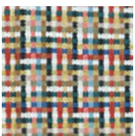
01 Jewel Tones