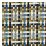
02 Ocean Dune