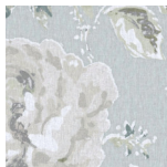
02 Duck Egg On Ecu