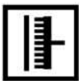
paste the wall

Our coated non-woven wallpapers are all “spongeable”. Grasscloth wallcoverings should be cleaned by dusting with a clean dry brush or by brush accessory on a vacuum cleaner.